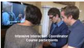
The course is highly practical, but includes all related theory