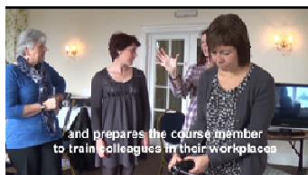
and prepares the course member to train colleagues in their workplaces

The course is highly practical, but includes all related theory